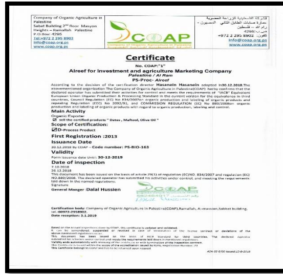
Al-Reef's certificate for Dates, Maftoul and Olive Oil