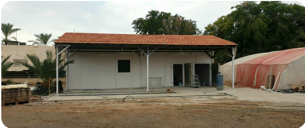
*The new lunch room*