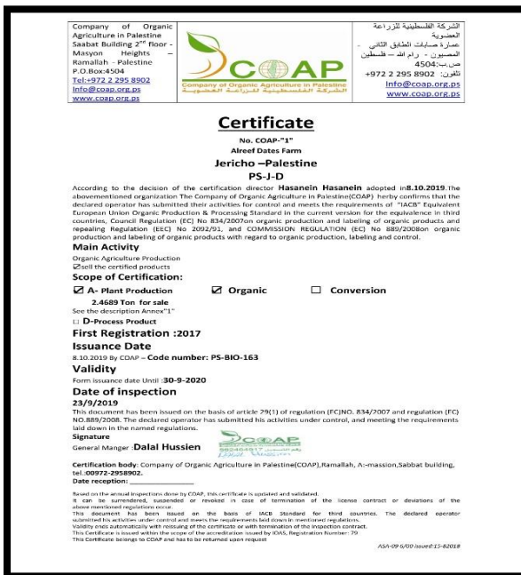
Al-Reef's dates farm certificate