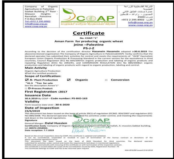
Aman Farm for producing wheat certificate