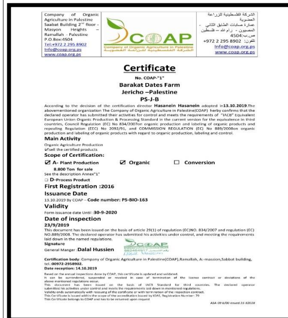
Amjad Barakat's dates farm Certificate