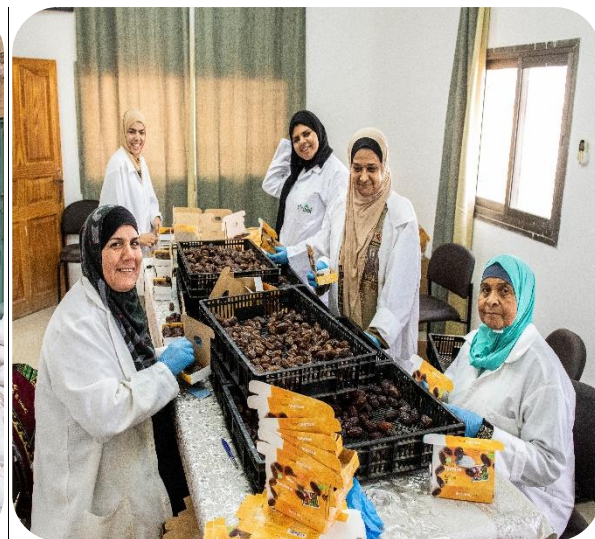
* Oxfam’s organic dates packs*